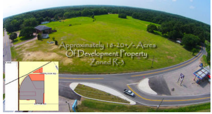
Mobile Mulit Family Land