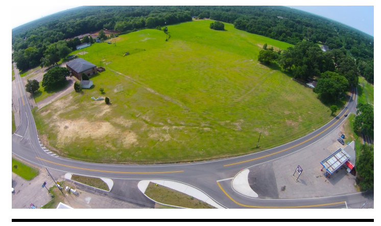
More Information Online

Paved Road Frontage with Utilities Available. Motivated Seller, will consider subdividing.