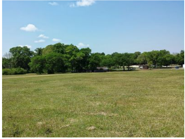
20140422_115512 - Copy