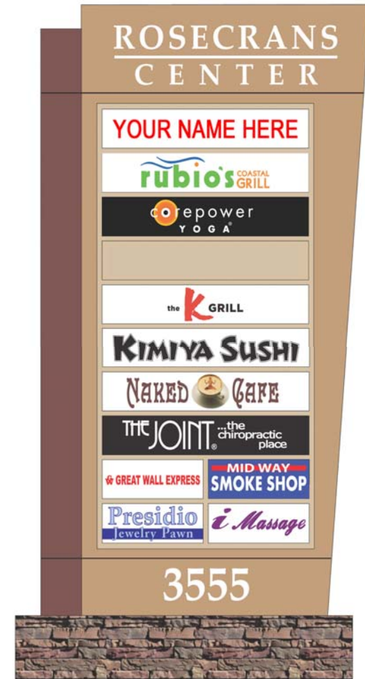
PROPOSED NEW MONUMENT SIGNAGE