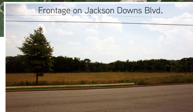
Frontage on Jackson Downs Blvd.