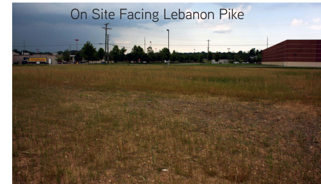
On Site Facing Lebanon Pike