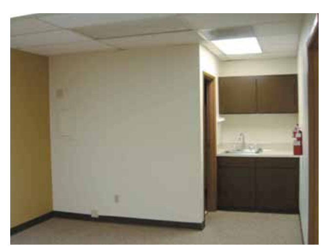
For a list of current vacancies, visit www.psbusinessparks.com, click on Oregon, then Milwaukie/International Way.