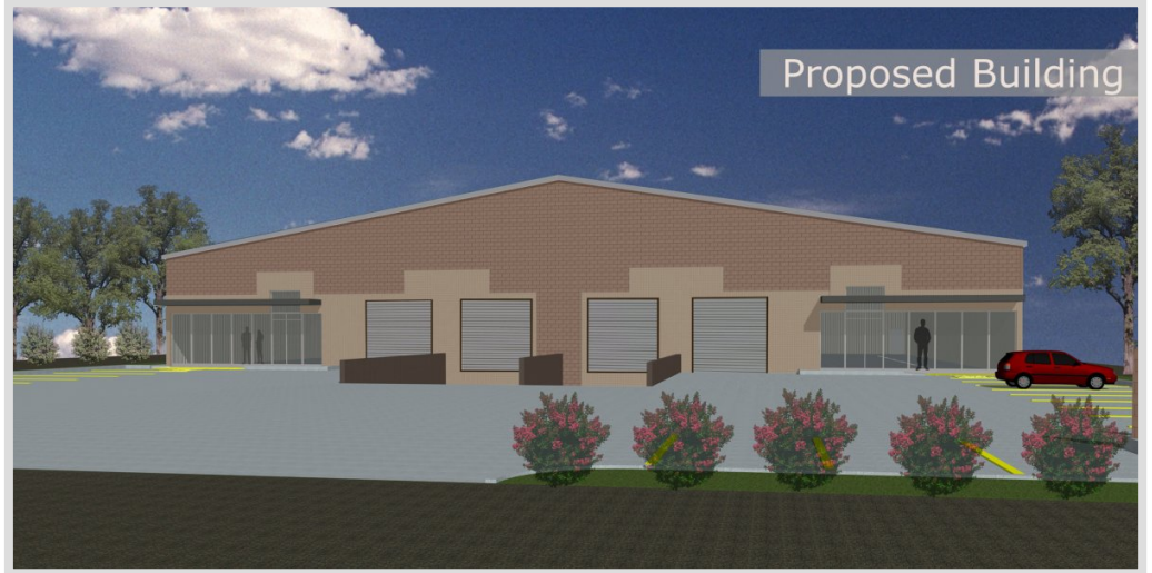
Proposed Building - Build to Suit Option