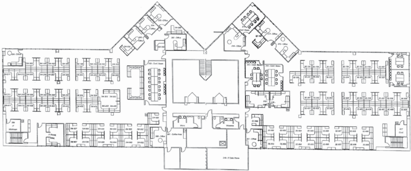
Third Floor Plan - 22,812 SF