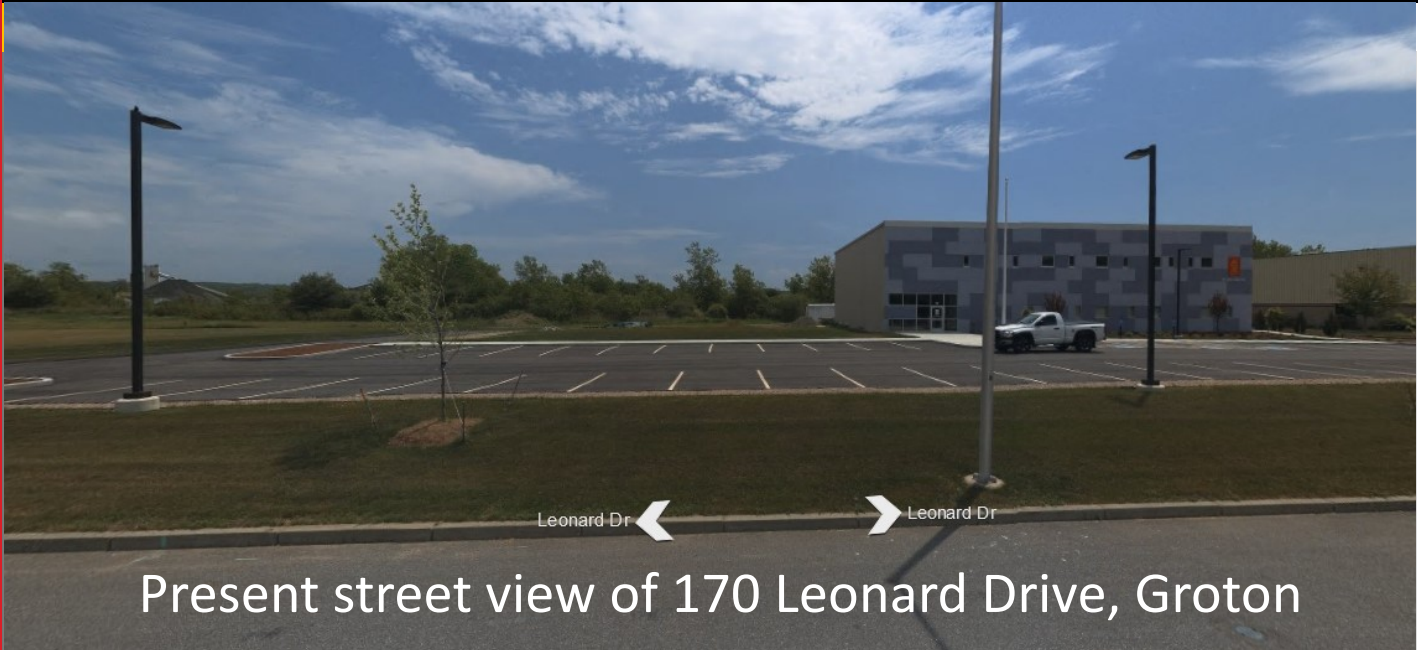
Present street view of 170 Leonard Drive, Groton