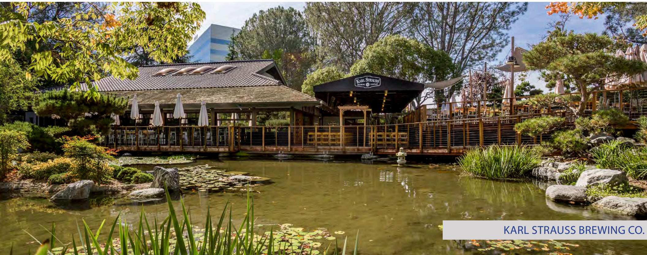
KARL STRAUSS BREWING CO.