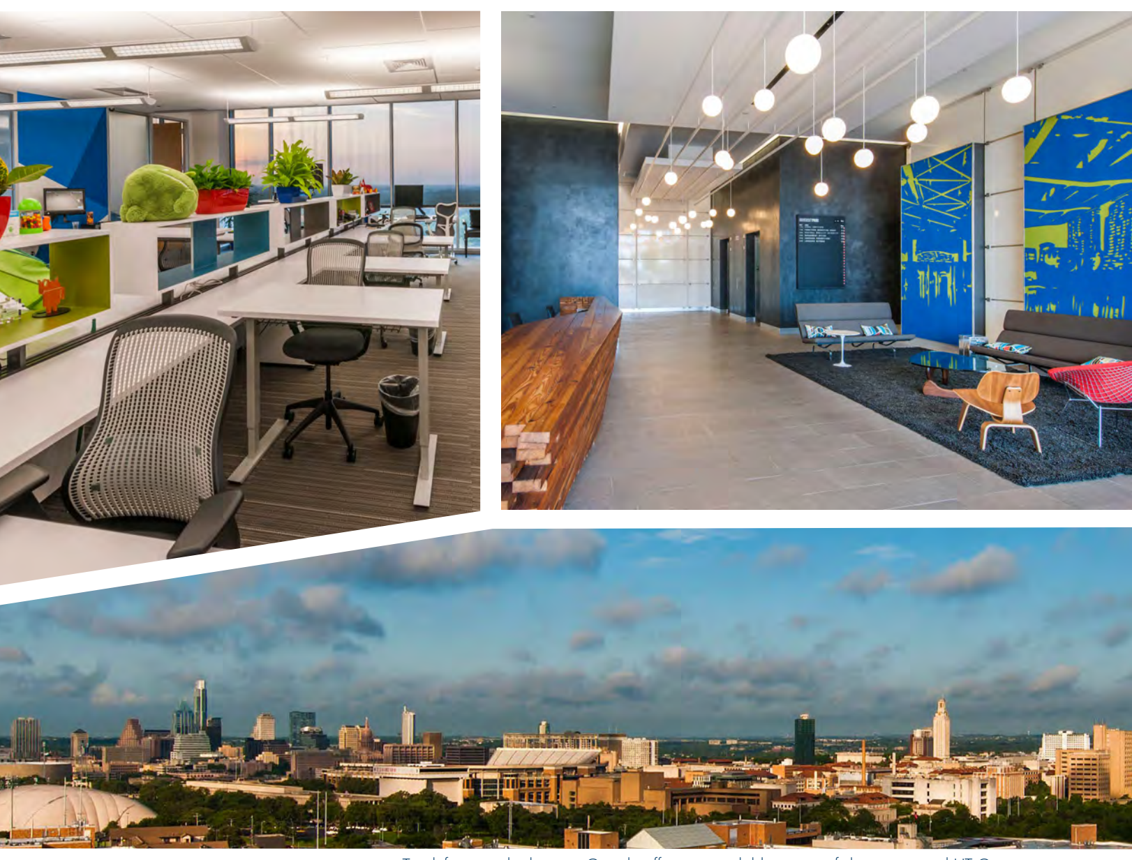
Top left, top right, bottom: Google office space, lobby, view of downtown and UT Campus

3300 N. INTERSTATE 35 • AUSTIN, TEXAS 78705