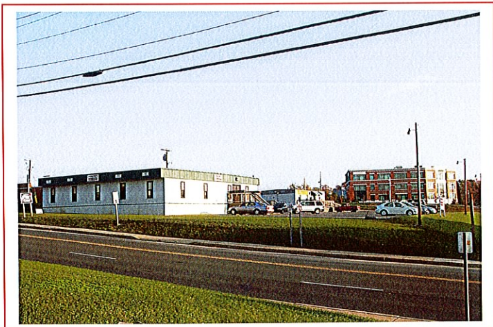
View of site from the Charles Street frontage. The temporary trailers on the site are no longer present.