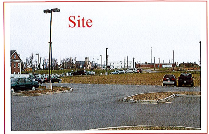
View of site from the northbound lane of Crain Highway, south of the intersection of Charles Street and Crain Hwy.