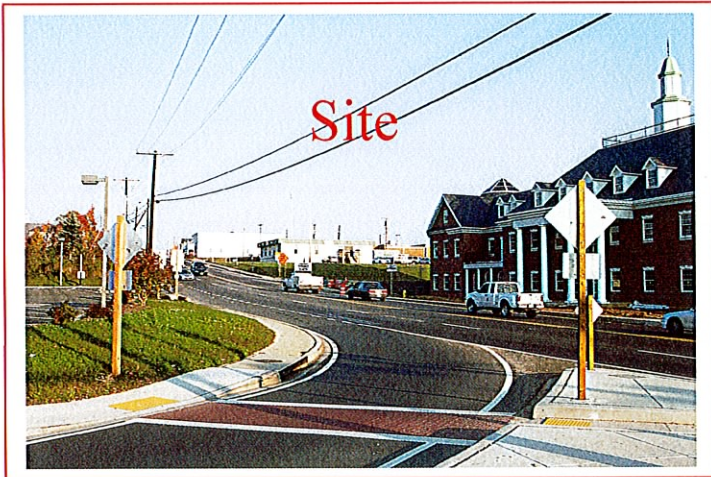
View of site from the intersection of Crain Hwy and Charles Street. Orientation of view is looking east towards downtown La Plata.