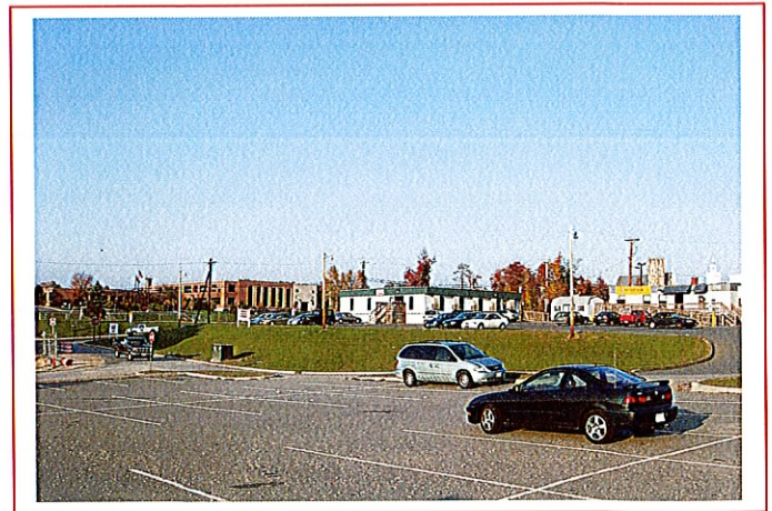
View of the site from adjoining parking lot located southwest of the site.