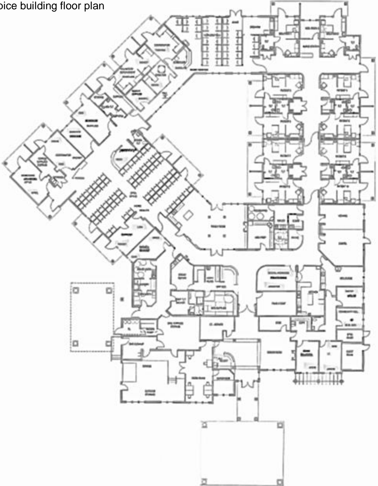
Hospice building floor plan

900 Washington St, Suite 850, Vancouver, WA 360.597.0574 | www.fg-cre.com