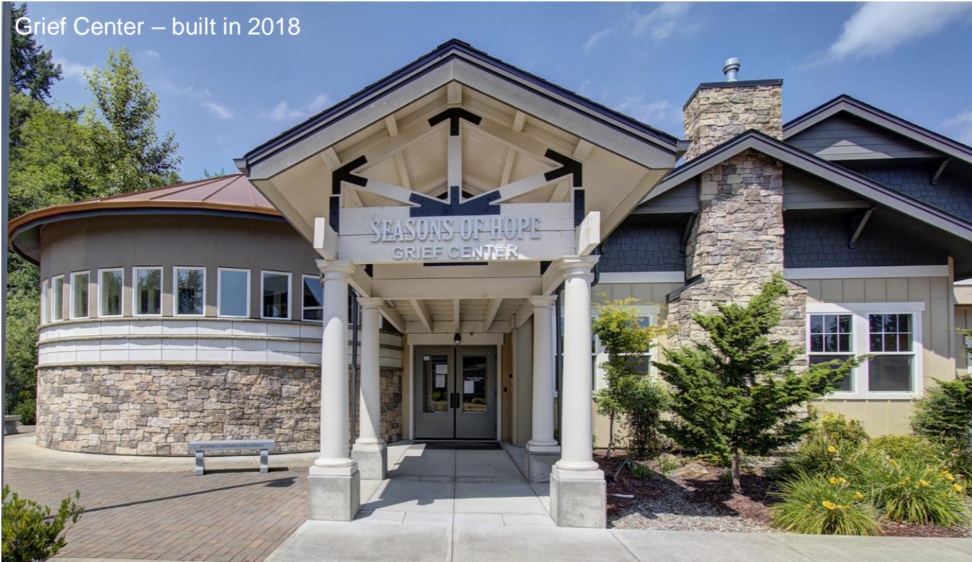
Grief Center – built in 2018

900 Washington St, Suite 850, Vancouver, WA 360.597.0574 | www.fg-cre.com