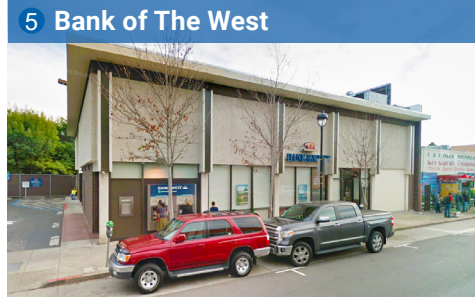
5 Bank of The West