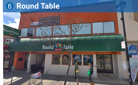
6 Round Table