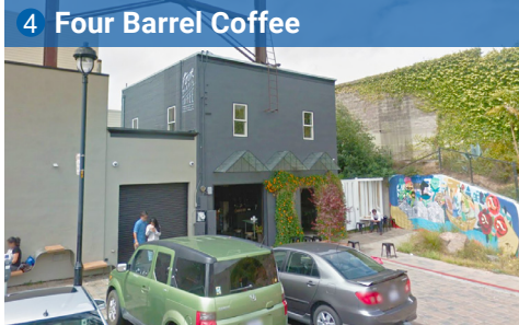
4 Four Barrel Coffee