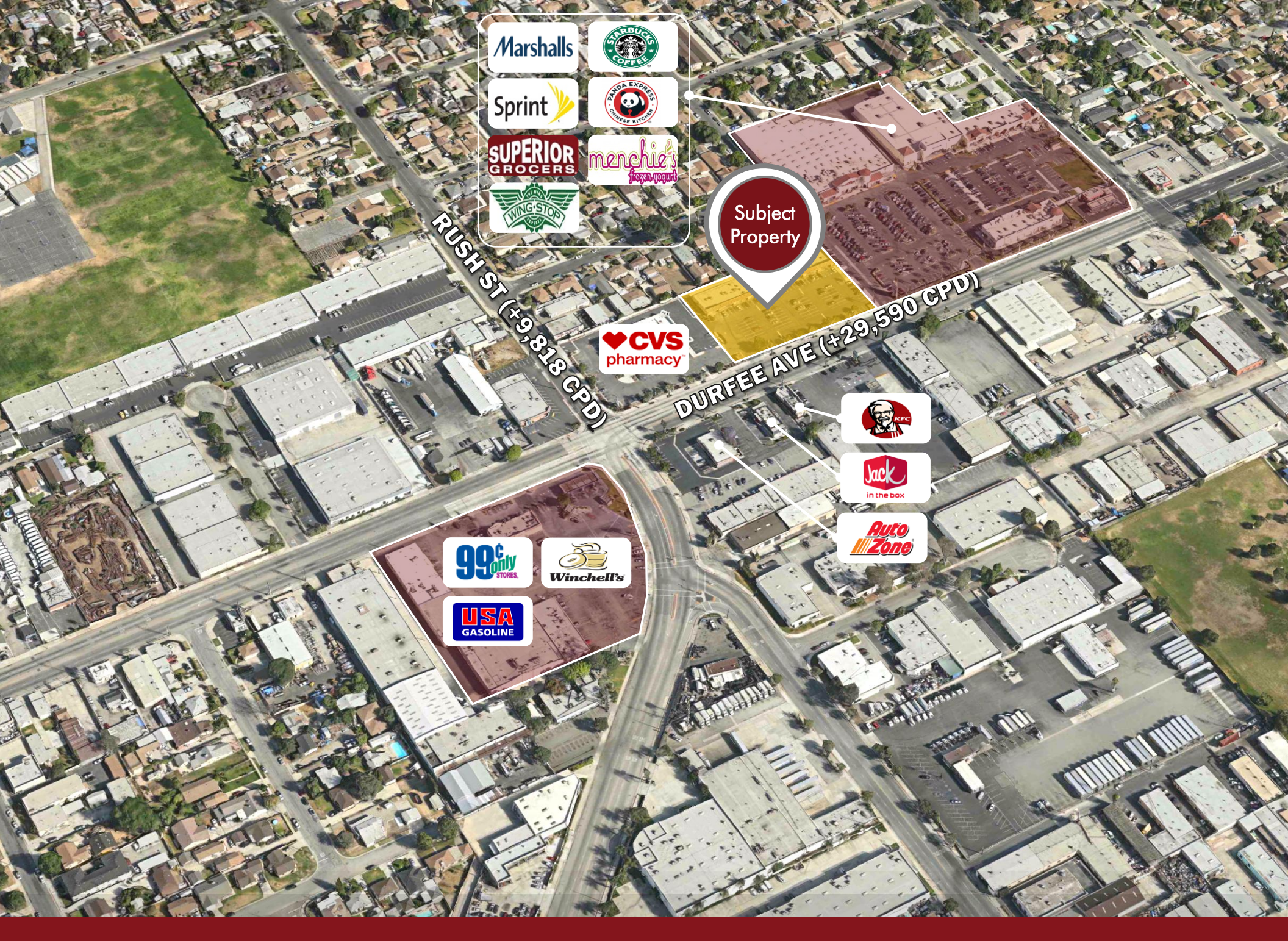
The information above has been obtained from sources believed reliable. While we do not doubt its accuracy, we have not verified it and make no guarantee, warranty or representation about it. It is your responsibility to independently confirm its accuracy and completeness.