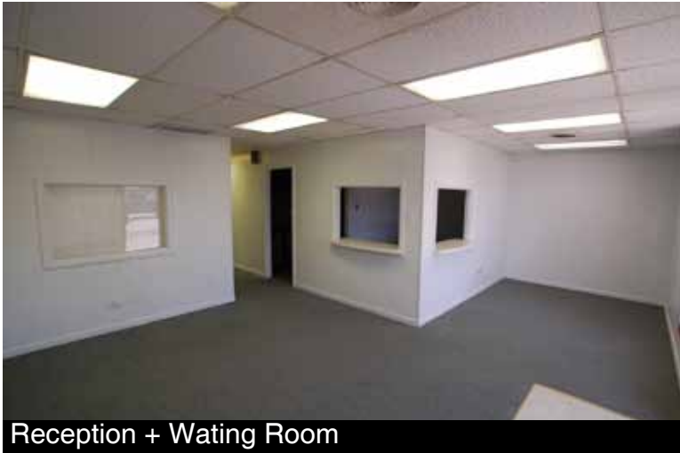
Reception + Waiting Room