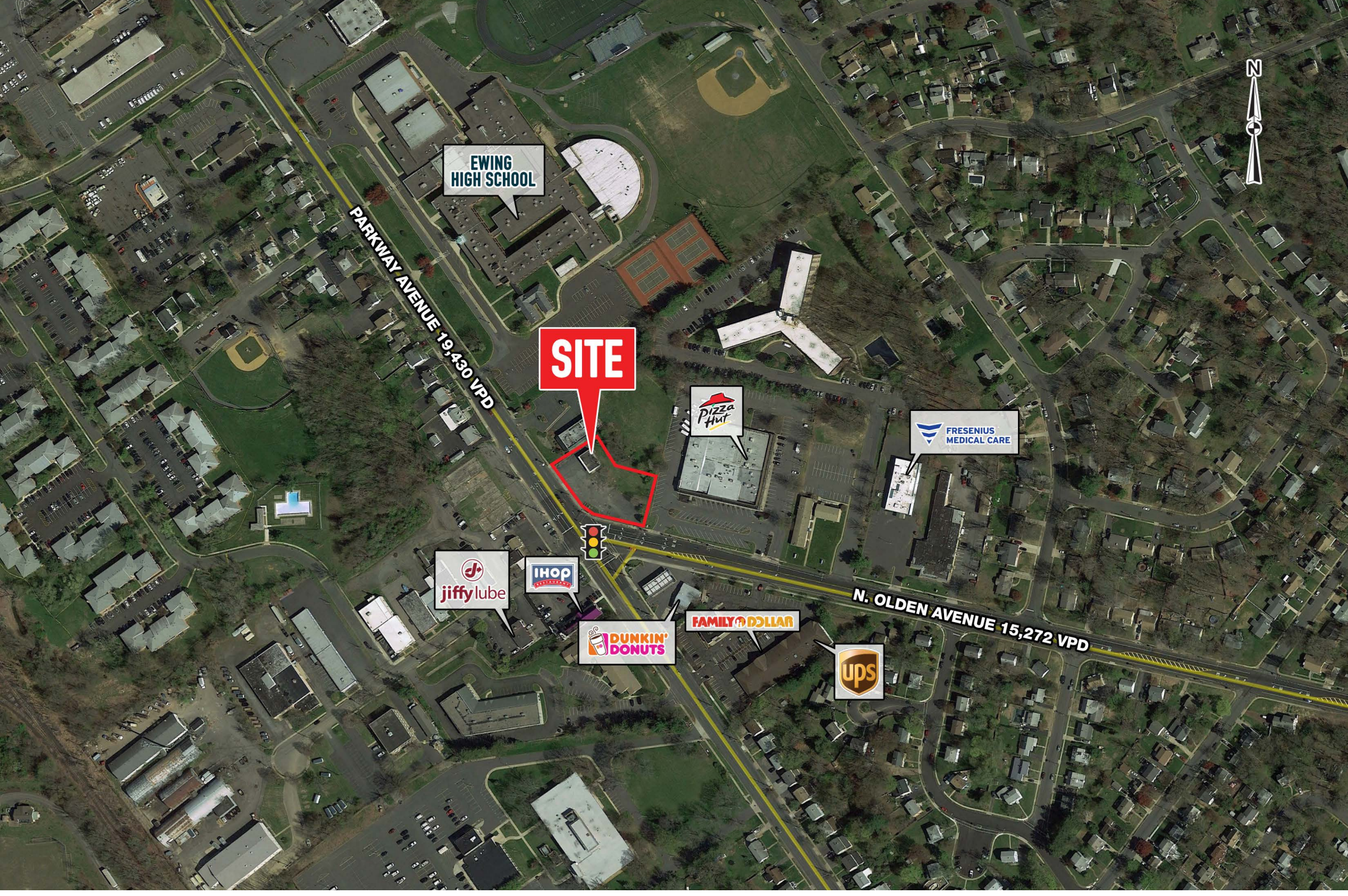
The information and images contained herein are from sources deemed reliable. However, Metro Commercial Real Estate, Inc. makes no representation whatsoever as to their accuracy or authenticity. Images shown may be modified for illustrative purposes. Images may be out-of-date and not current. 11.20.1