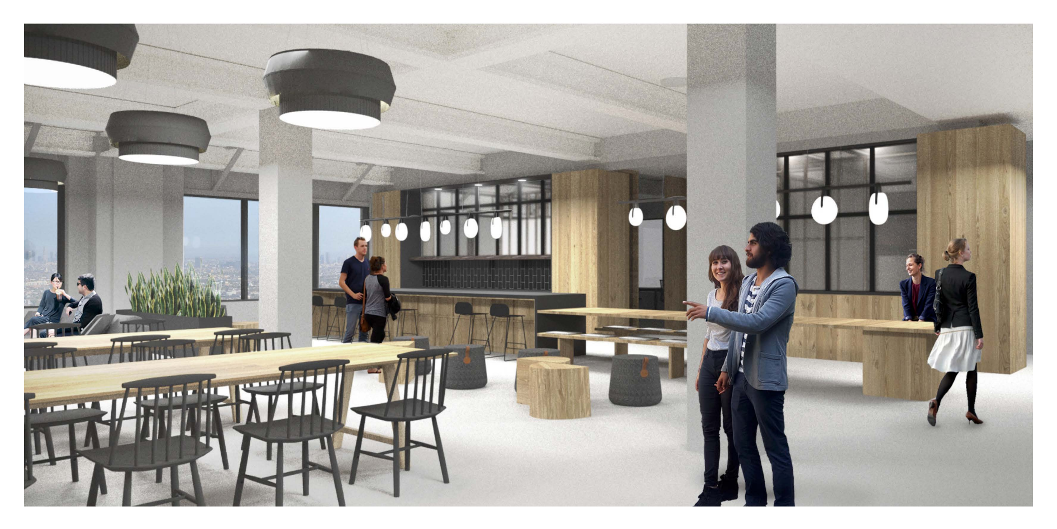
little tokyo location