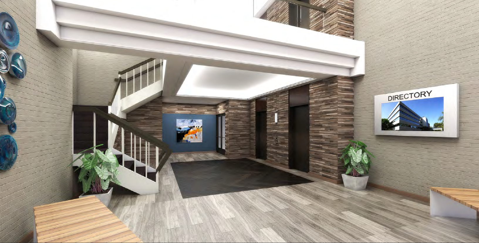
Eclectic, contemporary lobby renovation with a welcoming ambiance, new flooring, exposed brick, and wood accent walls