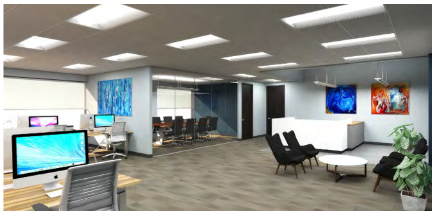
Suite 380 | Creative, contemporary build-out with upgraded lighting, flooring, and fishbowl conference room

Space availabilities range from 800 square feet to a full floor.