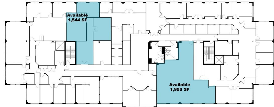
2 nd Floor Plan