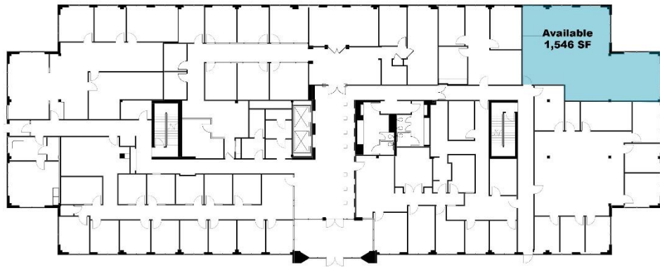
1 st Floor Plan