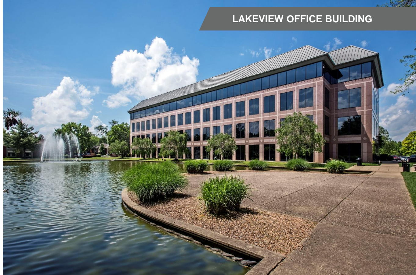
LAKEVIEW OFFICE BUILDING