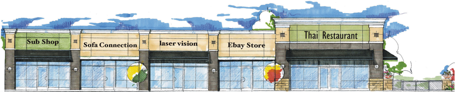
Building 1 - North Elevation

NE Corner, Kirby Pkwy & Shelby Drive | Memphis, TN 38141