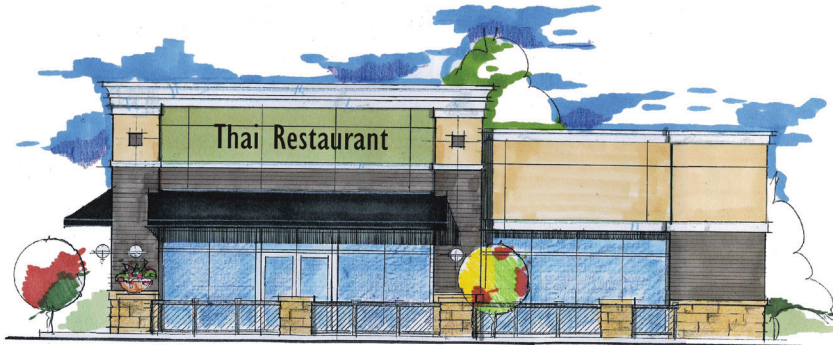
Building 1 - East Elevation