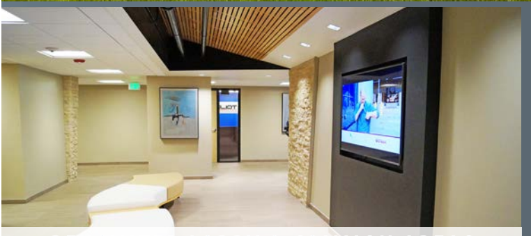
RENOVATED LOBBY & COMMON AREAS