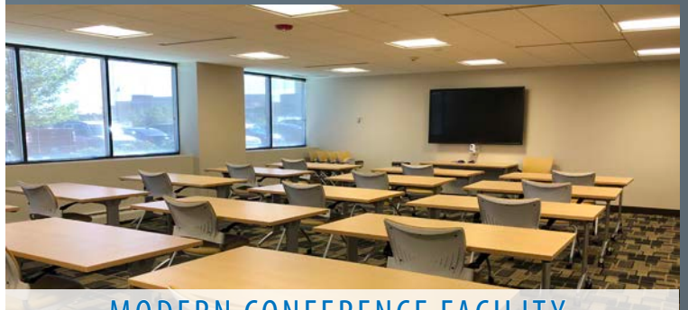
MODERN CONFERENCE FACILITY

W. Ryan Stout 303.813.6448 ryan.stout@cushwake.com