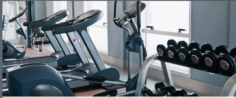
NEW FITNESS FACILITY!