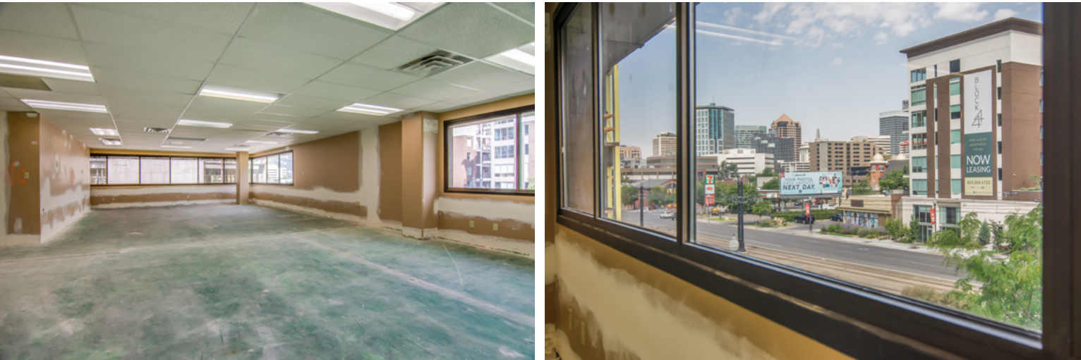
AVAILABLE SHELL SPACE READY FOR TENANT IMPROVEMENTS