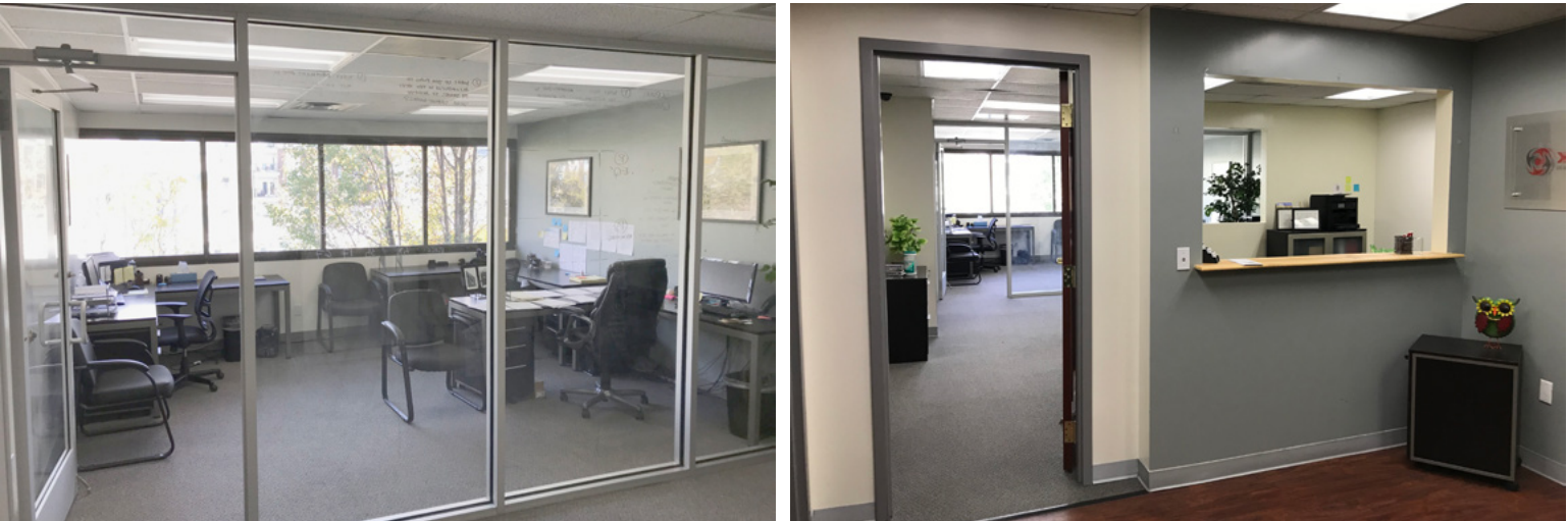
SUITE 311 MOVE-IN READY