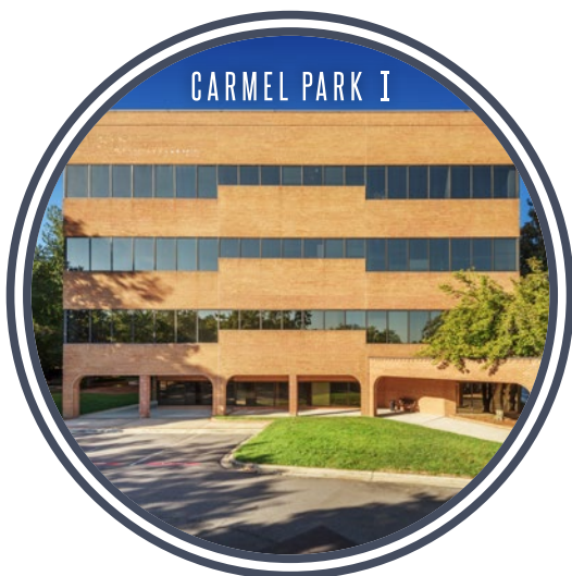
CARMEL PARK I

Located in the heart of South Charlotte, surrounded by amenities. Carmel Park's dedicated ownership has updated common areas, bathrooms, the courtyard, and more. Carmel Park offers tremendous value in one of South Charlotte's best locations, with easy access to many of the city's most desirable neighborhoods.