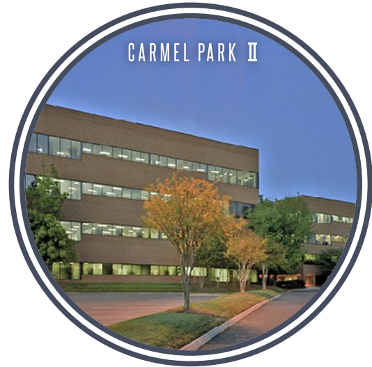
CARMEL PARK II