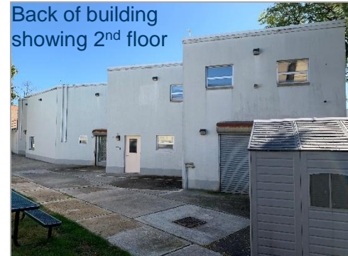
Back of building showing 2 nd floor