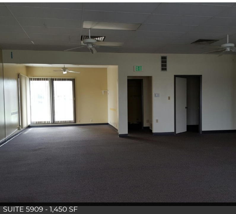
SUITE 5909 - 1,450 SF