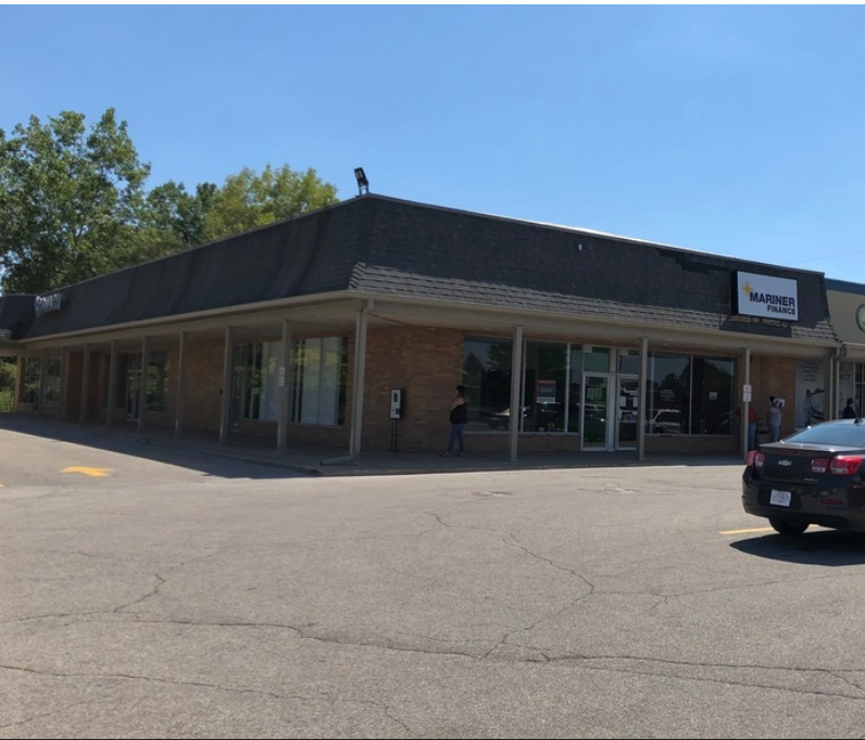
SUITE 6007 - END CAP UNIT - 1,091 SF