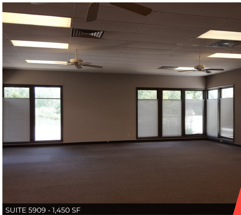
SUITE 5909 - 1,450 SF

KIENAN O'ROURKE 260.450.8443 korourke@xplorcommercial.com