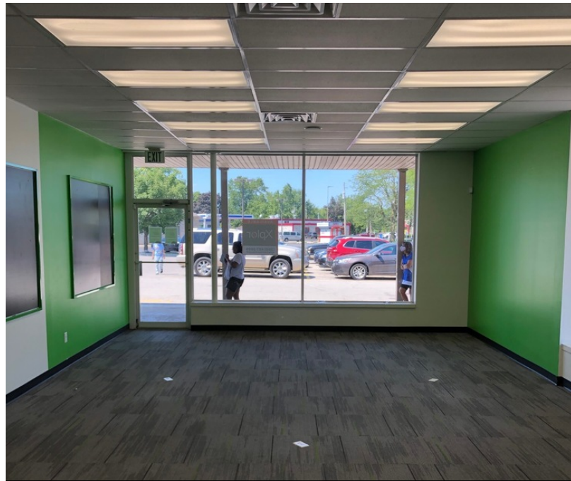
SUITE 6007 - END CAP UNIT - 1,091 SF