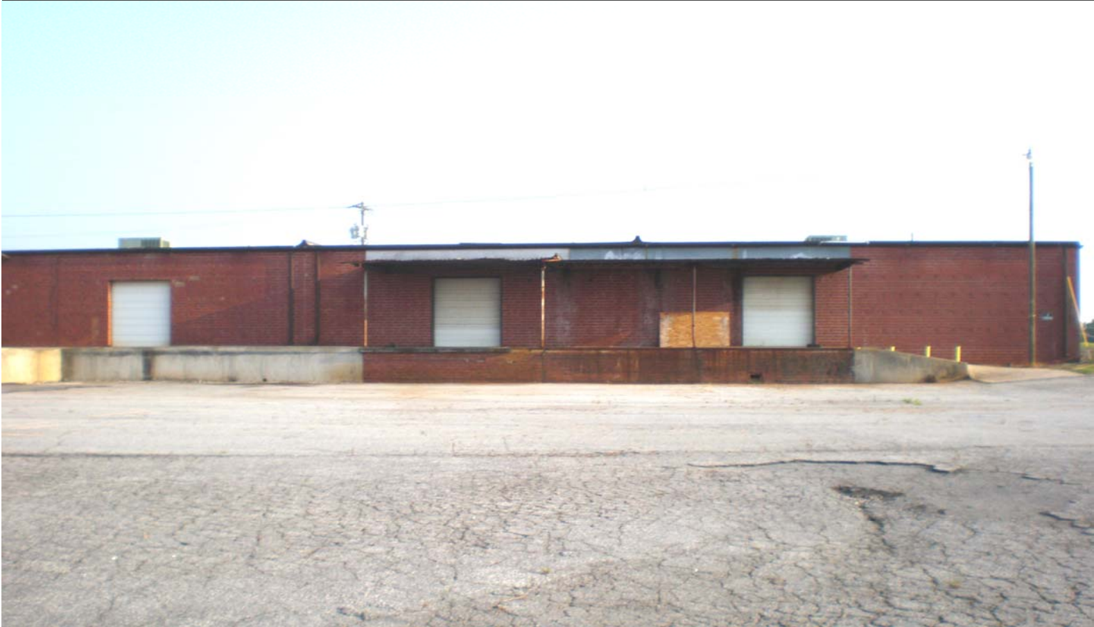
BUILDING 1 SIDE & BACK VIEW