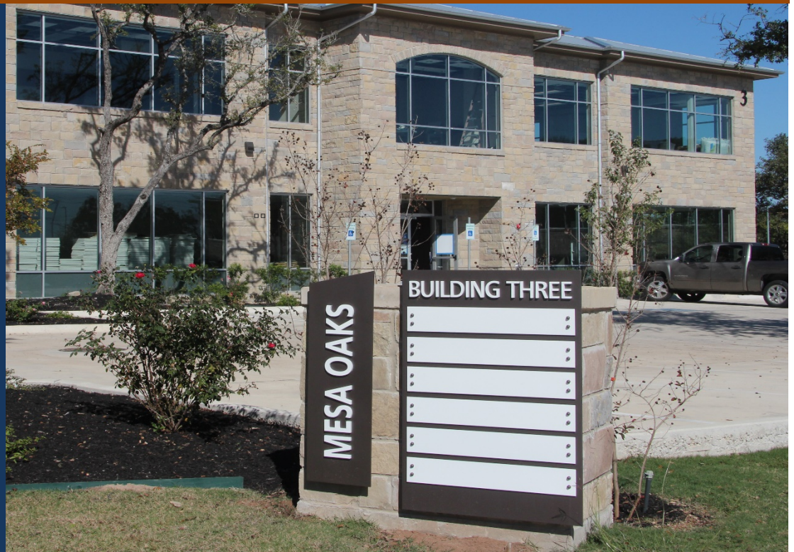
Tenant Lobby Space