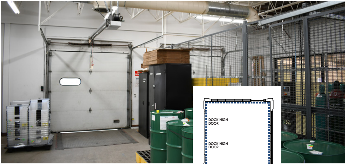
2 DOCK-HIGH DOORS