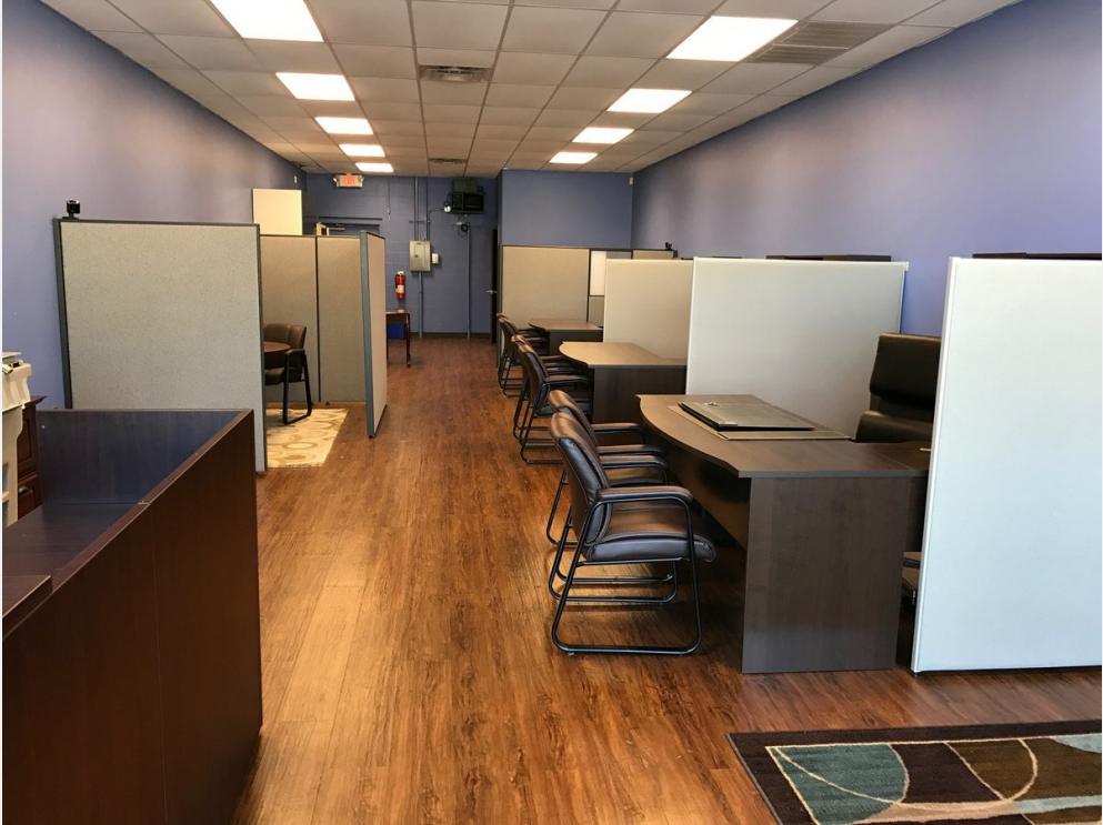
Suite 101-Full View of Open Office Floor Plan