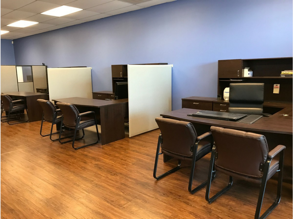
Suite 101-3 Private Cubicles with Desks