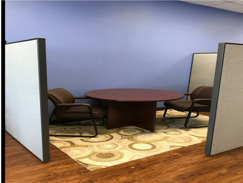
Suite 101-Private Conference_Consulting cubicle