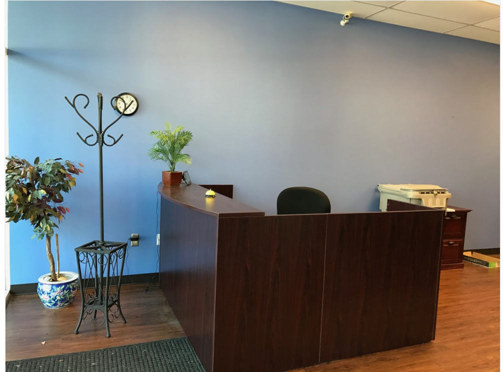
Suite 101-Receptionist Desk