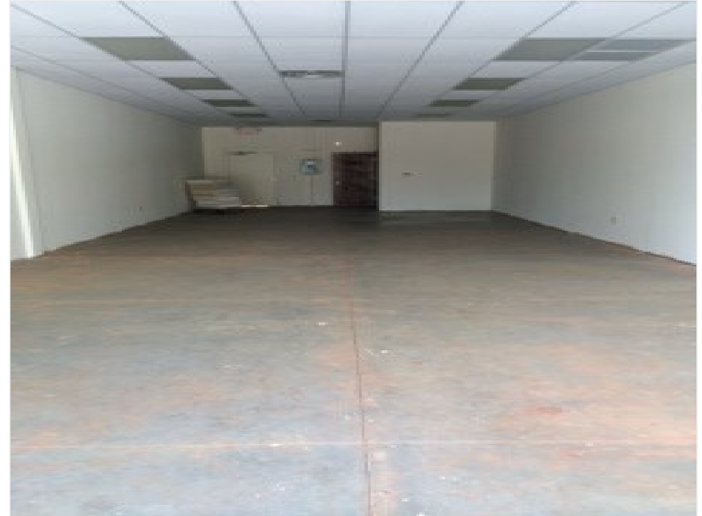
Suite 104 and 105- Interior