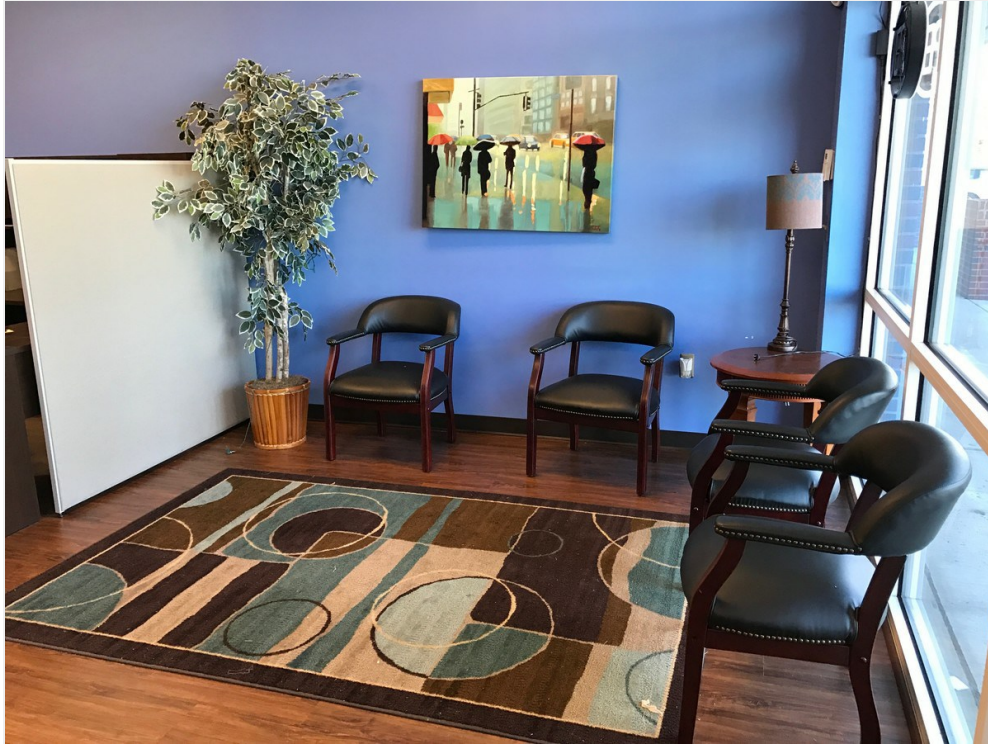
Suite 101-Waiting Area