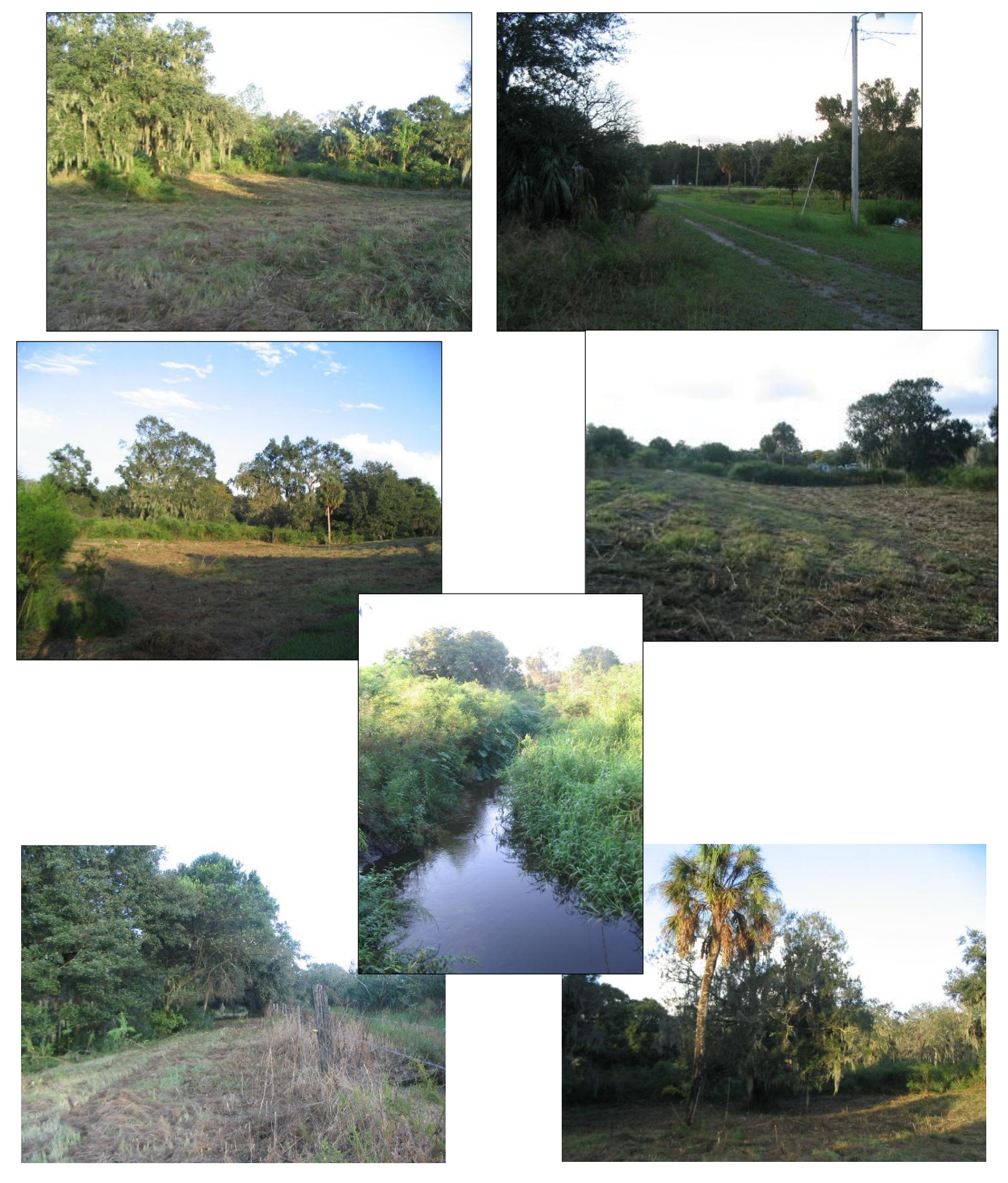
DISCLAIMER: Information contained herein is from sources deemed reliable, but not verified and no warranty is made as to the accuracy thereof. This offering is made subject to errors. Omissions, change of price or other conditions, prior sale or lease or withdrawal without notice. Prospective buyers/ tenants are encouraged to verify, independently, all pertinent data. The Mahoney Group, Inc. 3825 S. Florida Avenue, Suite 5, Lakeland, Florida 33813 is the agent of and represents the Owner/Landlord of this property.