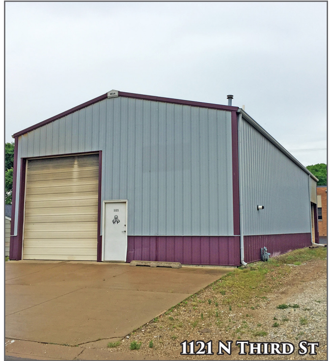
1121 N THIRD ST