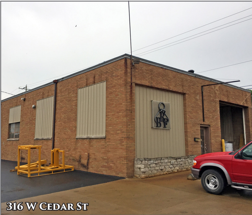
316 W CEDAR ST

316 CEDAR & 1121 THIRD, CHILlicothe 5,694 SF (2 BUILDINGS) FOR SALE