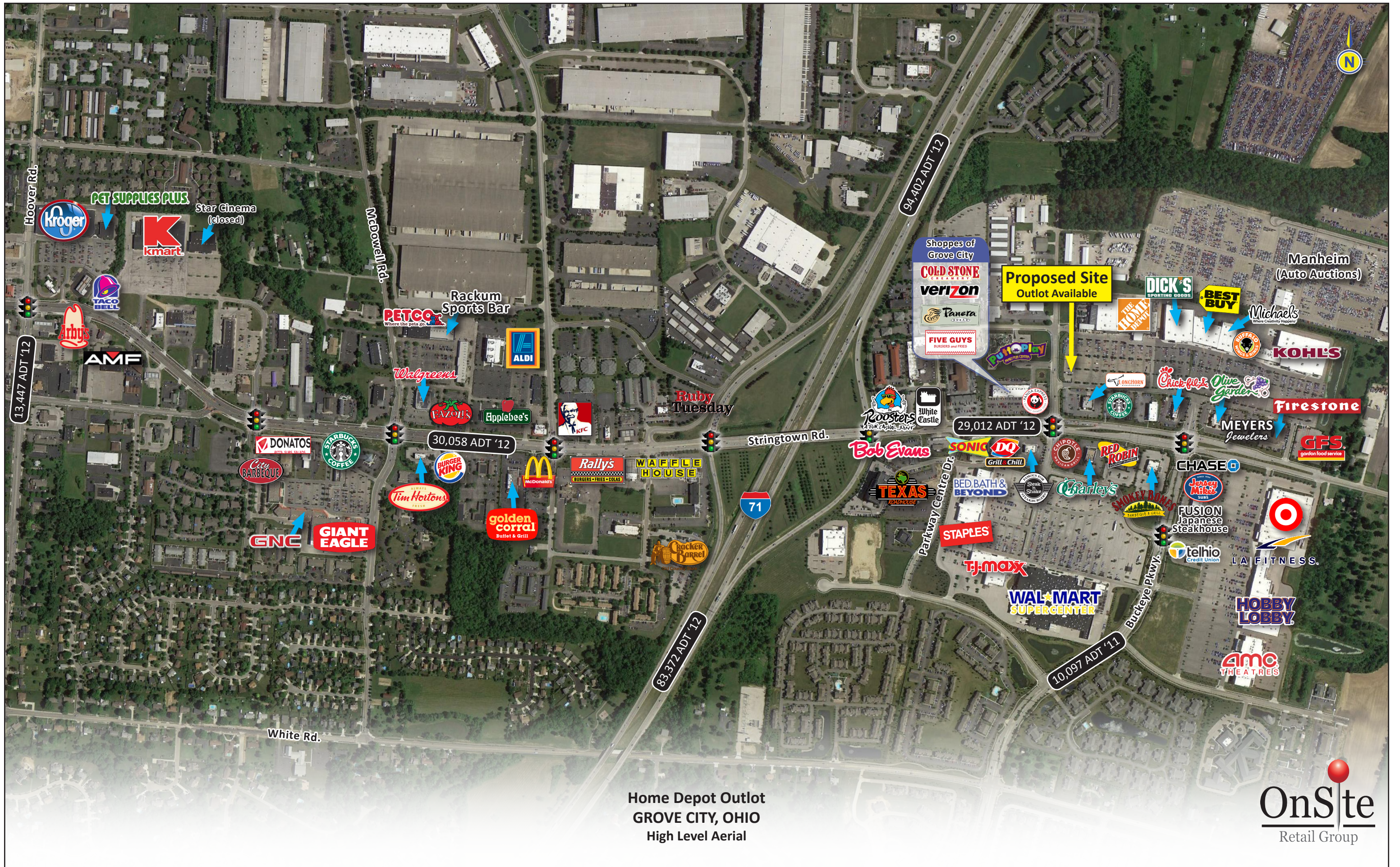
Home Depot Outlot GROVE CITY, OHIO High Level Aerial