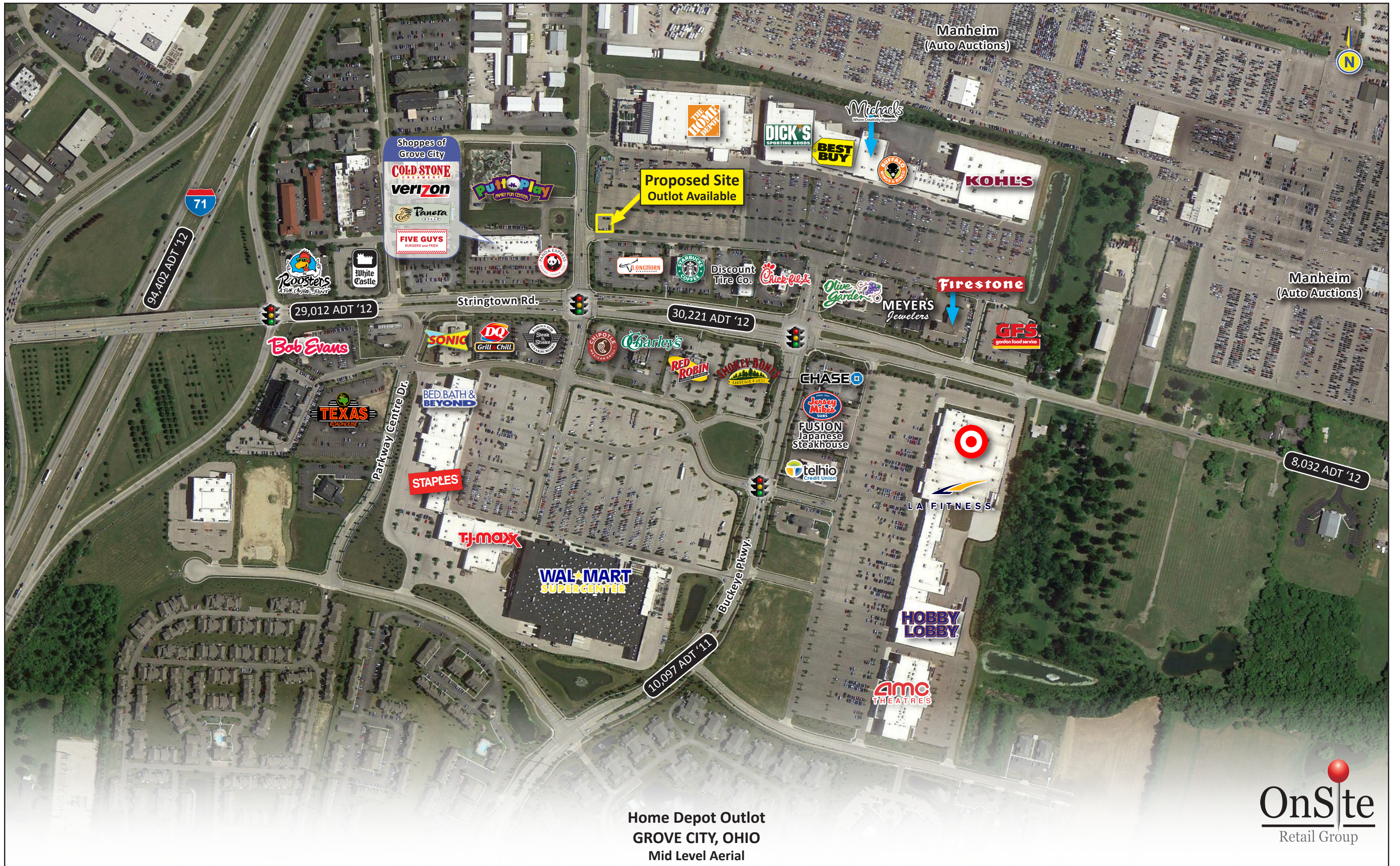
Home Depot Outlot GROVE CITY, OHIO Mid Level Aerial