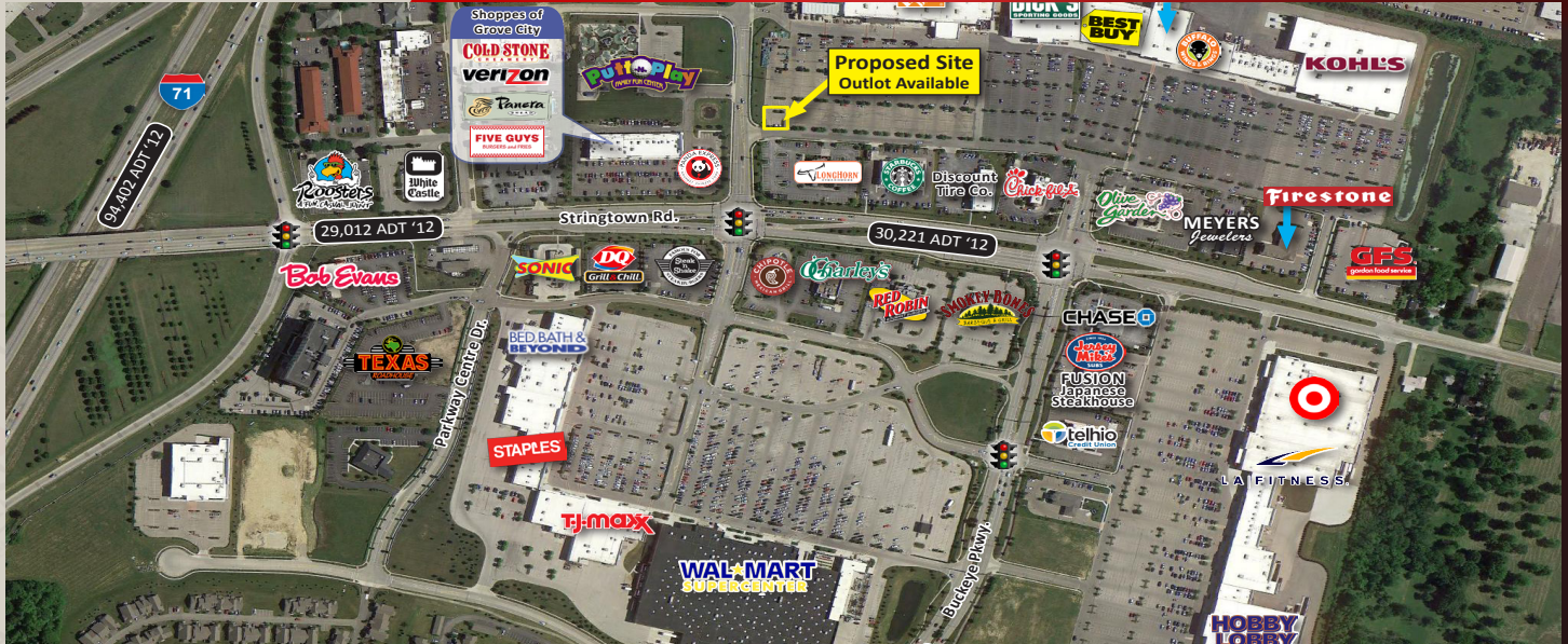
Grove City, Ohio, NE Corner of Stringtown Rd. & Thistlewood Dr.