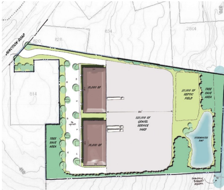
PRELIMINARY SKETCH 816-818 Junction Road Durham, NC