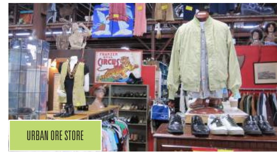
URBAN ORE STORE