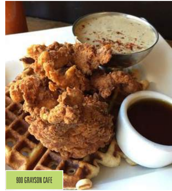
900 GRAYSON CAFE