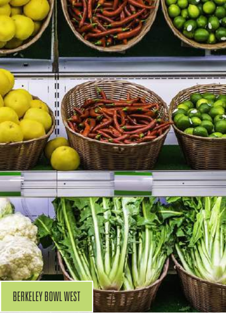
BERKELEY BOWL WEST