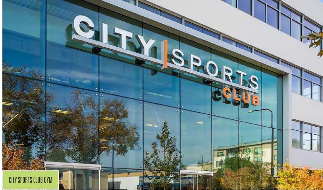
CITY SPORTS CLUB GYM