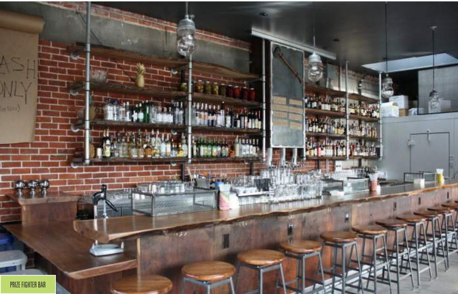
PRIZE FIGHTER BAR