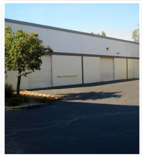
REAR & SIDE LOADING