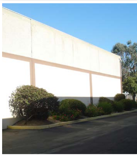
DRIVE AROUND ACCESS