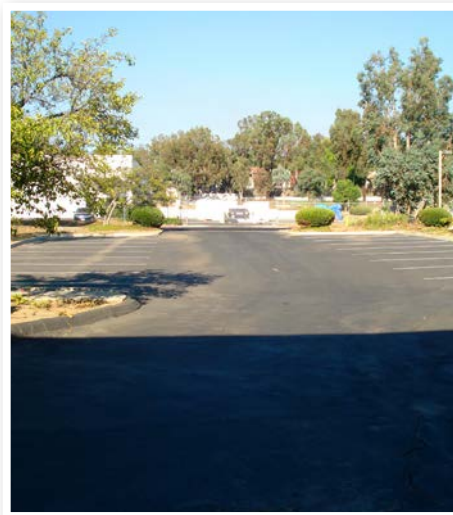
EXTRA PARKING LOT IN REAR