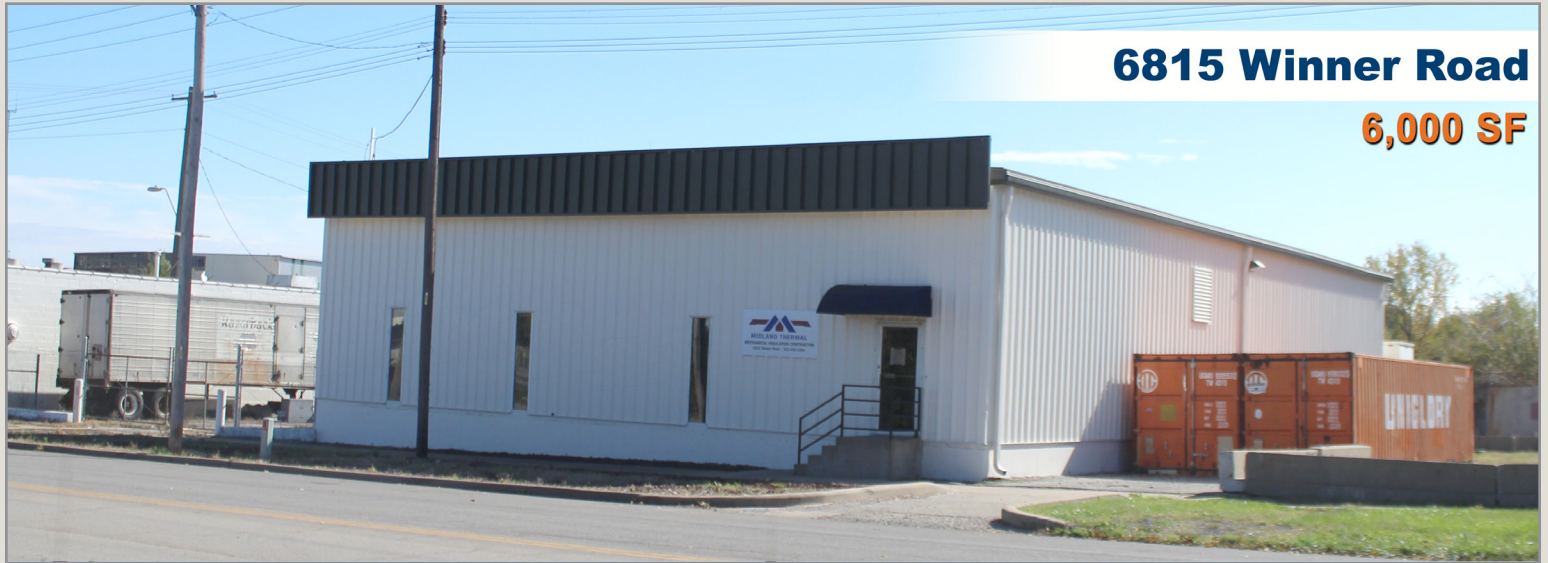
6815 Winner Road