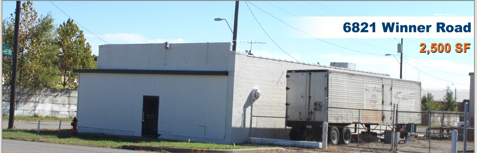
6821 Winner Road