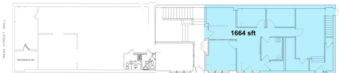
400 East Main Street - First Floor

Space includes reception area, several offices and conference room. Wonderful visibility with entrances off 4 th Street at the vehicular crossing.