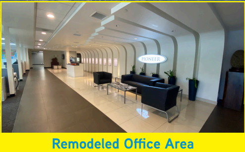
Remodeled Office Area