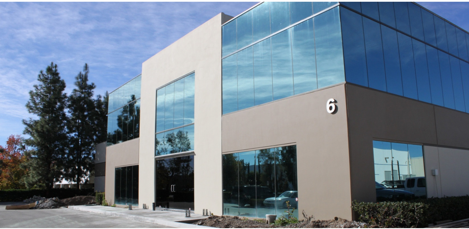
6 Chrysler, Irvine Spectrum