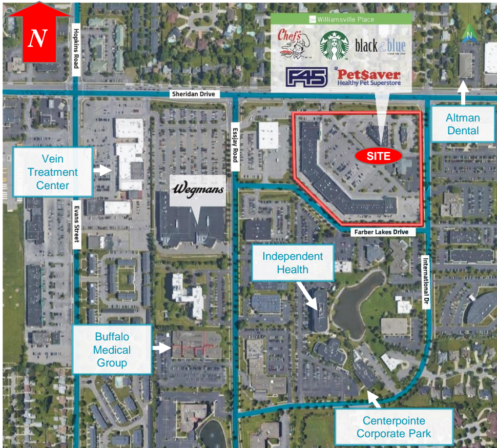
Existing Area Medical Users

Professional and Medical Office / For Lease