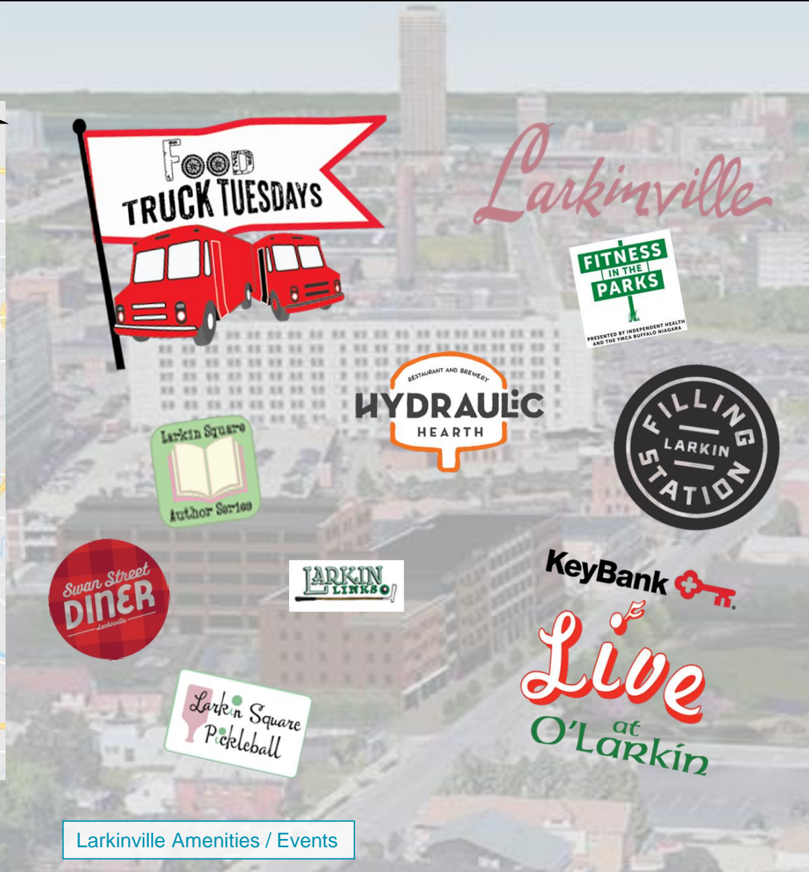
Larkinville Amenities / Events