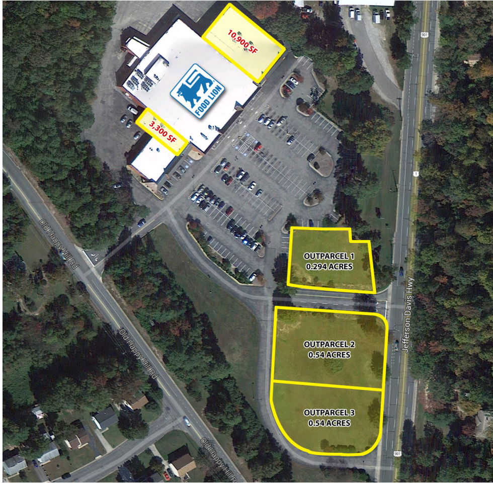
Outparcels located in Chesterfield County