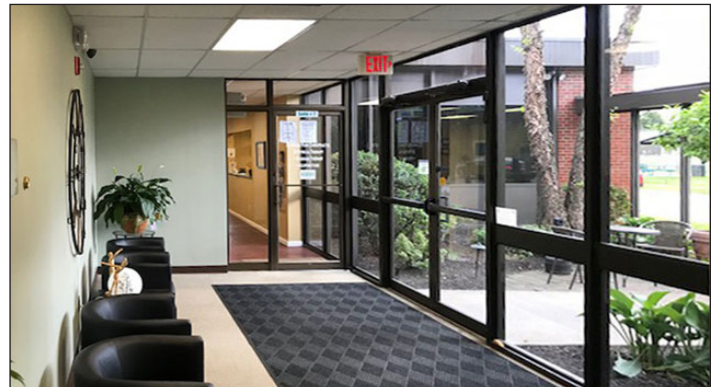
Common courtyard lobby to both spaces and main entrance to 2,425 SF space shown at left.