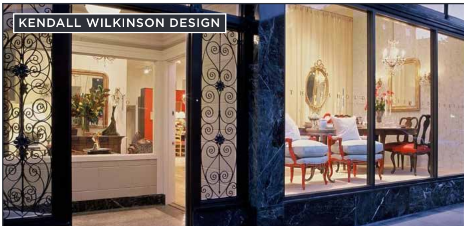
KENDALL WILKINSON DESIGN