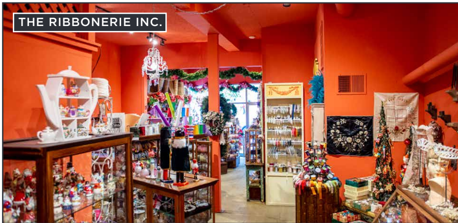
THE RIBBONERIE INC.