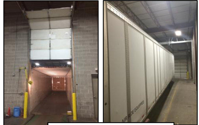
Enclosed Docks (4)

Construction Date: 1985, 1988, 1995 Fire Protection: Overhead Sprinkler System Rentable S.F.: 46,750 Exterior Wall: Precast concrete panels Ceiling Height: 21' to roof deck, 18-19.6 feet clear Column Spacing: 39.4' on center Foundation: Precast concrete with reinforced concrete footings Floor Structure: Reinforced concrete slab on grade / covered in sealed concrete Lighting: Exposed fluorescent & metal halide—warehouse Docks: 4 docks HVAC: Radiant heat plus some HVAC Roof: Pitch & Gravel over built-up composition roof Pricing: $4.50SF Net Lease Rate