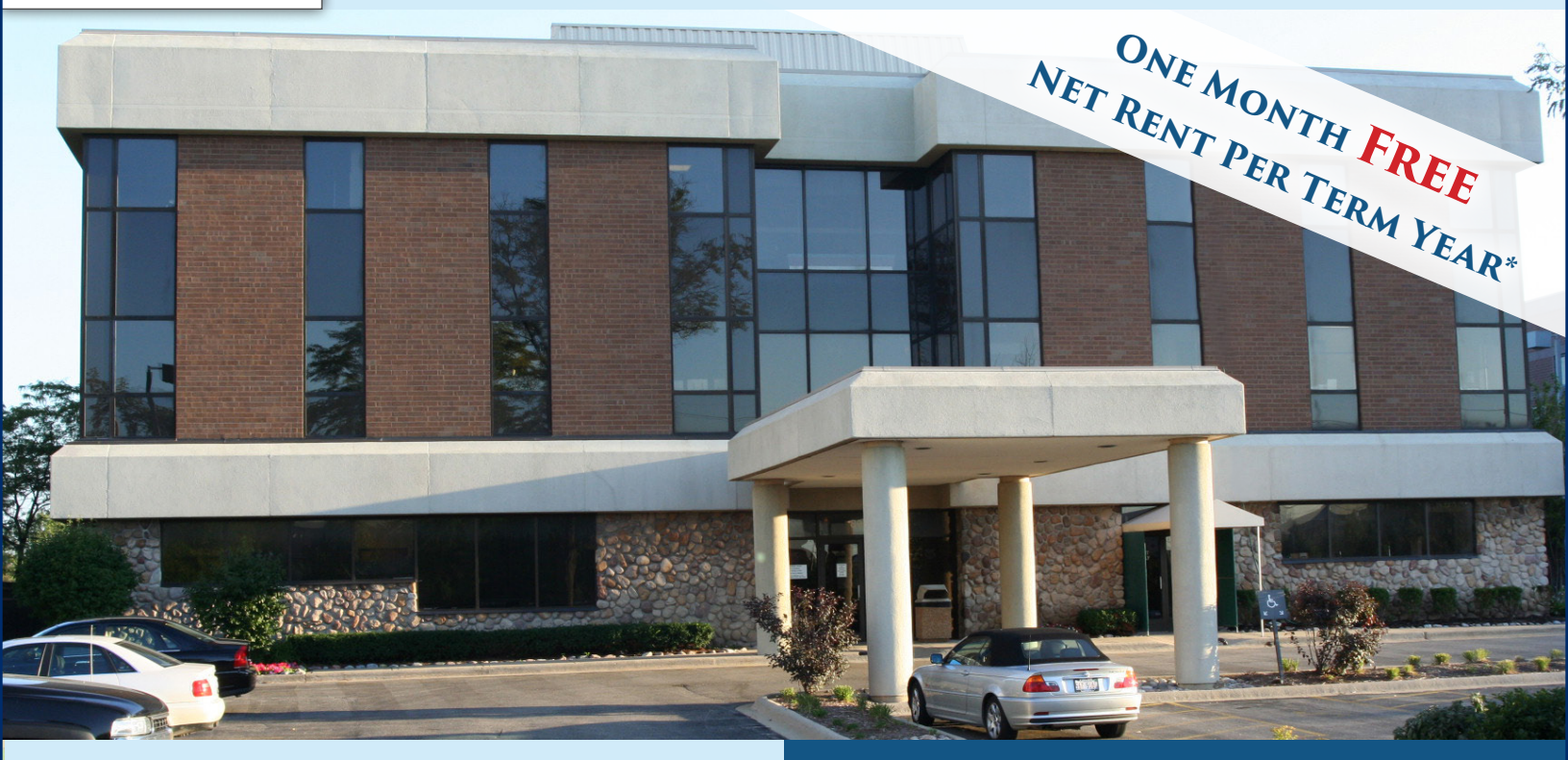
Lutheran General Hospital located less than 1 mile south!

FOR LEASE Fully Built-Out Medical & Sleep Center Suites Available Golf Surgical Center | 8901 Golf Road | Des Plaines, Illinois