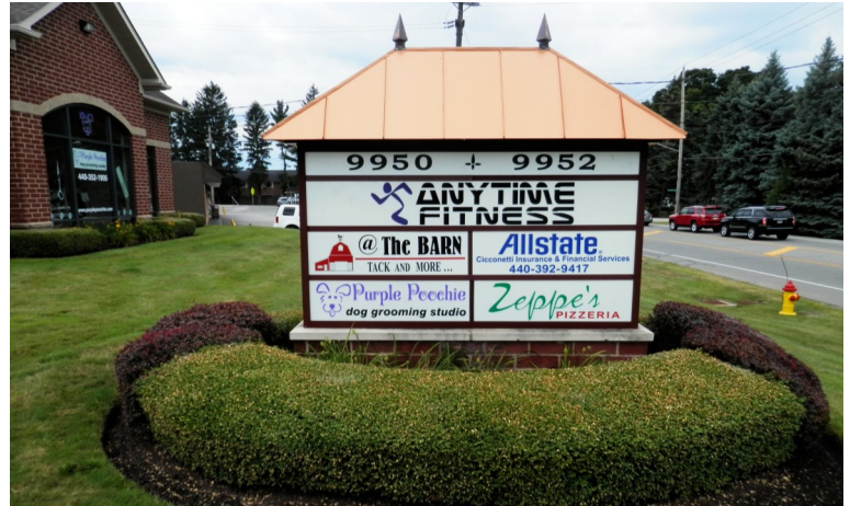
Johnnycake Ridge Rd (SR 84)