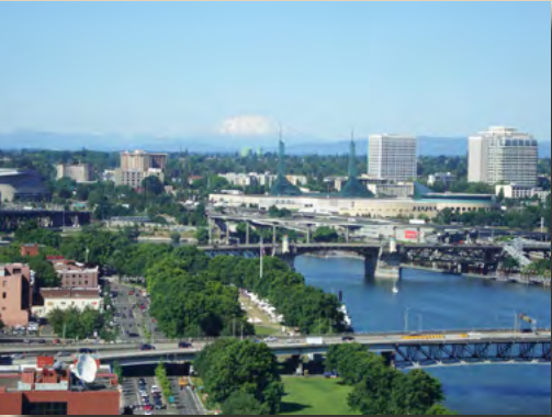
Mt. St. Helens