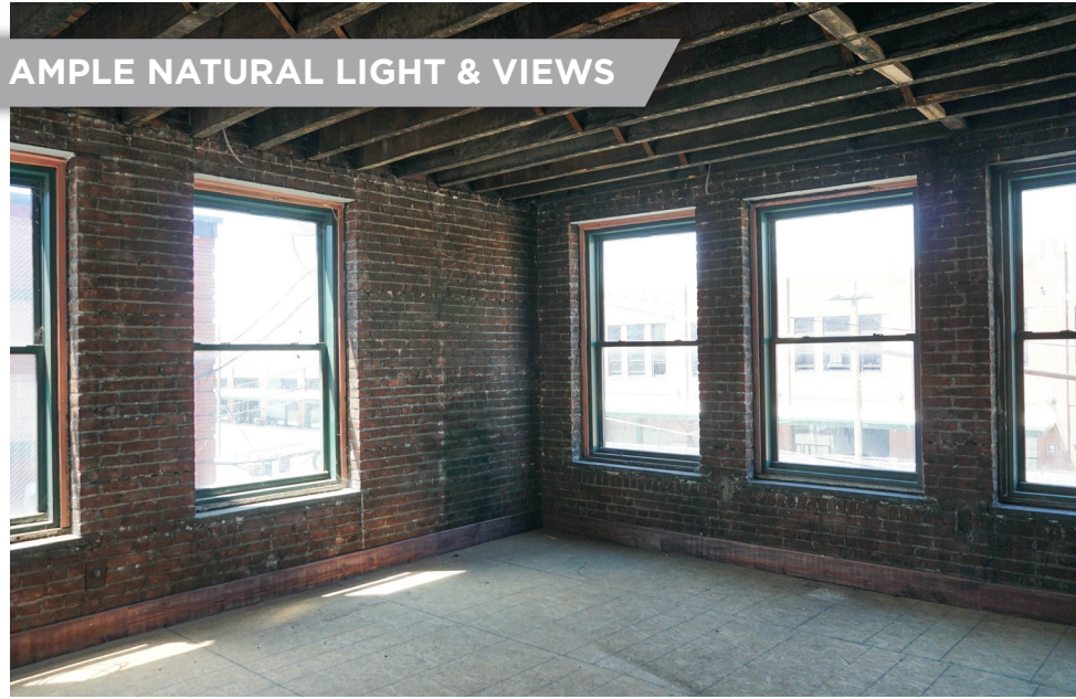
AMPLE NATURAL LIGHT & VIEWS