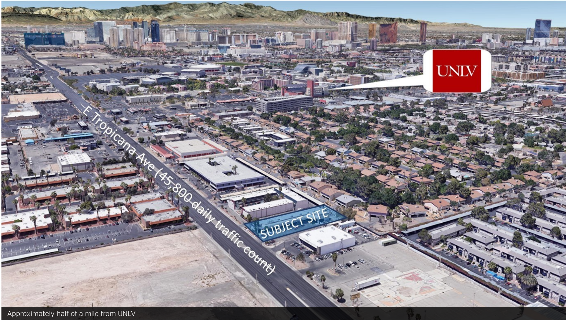
Approximately half of a mile from UNLV