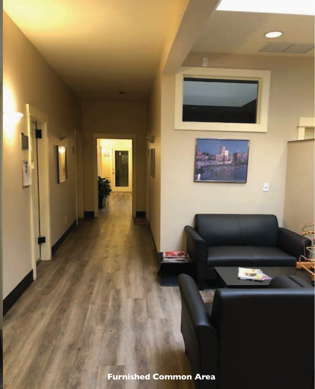
Furnished Common Area

PROFESSIONAL OFFICES & LIGHT MEDICAL SPACES AT NE MLK & RUSSELL STREET