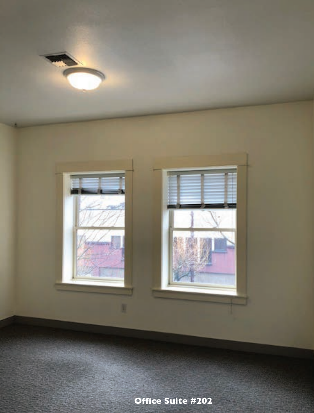
Office Suite #202